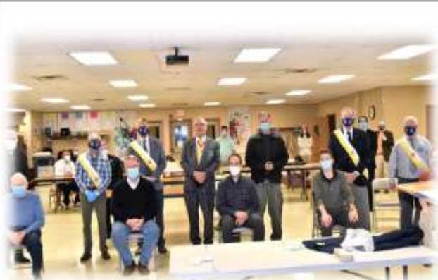
Exemplification Team and New Members