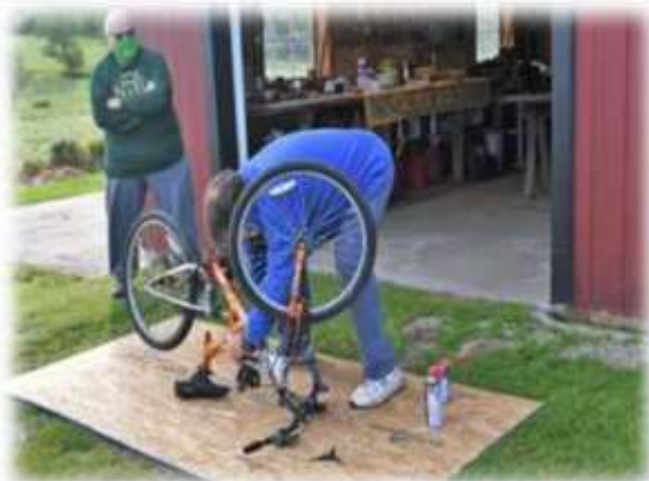
Bob Bessette Picks up Some Pointers