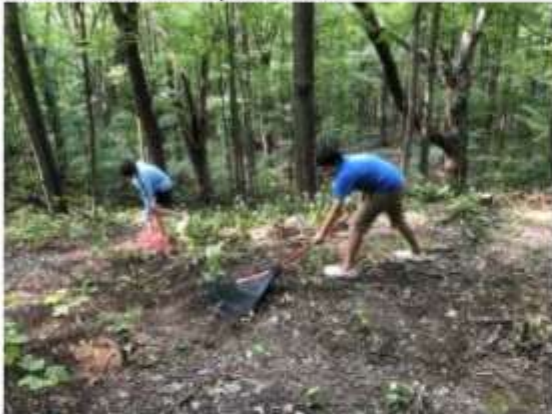
Caption: Grand Knight Garibay is cleaning up the lane by raking leaves. Several small trees were