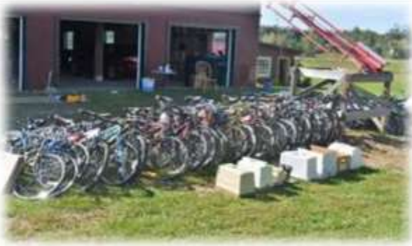
The End of the Task- 40 Bikes and 8 Sewing Machines