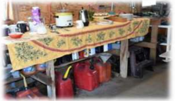
Goodies Were Available including Hot Apple Cider